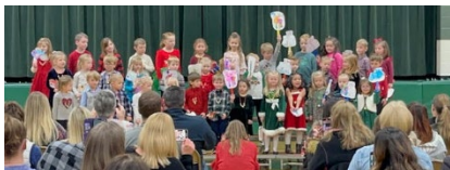
4K and Kindergarten students performed a holiday program on December 18 and 19.

Dress for the weather! Students will be outside when the weather is zero or above with the wind chill. Students need to have coats, hats, gloves, scarves, boots, and snow pants. Just a reminder, students need boots and snowpants to play when it's wet or snowy. It is a good idea to label your child's clothing. We have many "lost and found" items in our containers by the cafeteria.